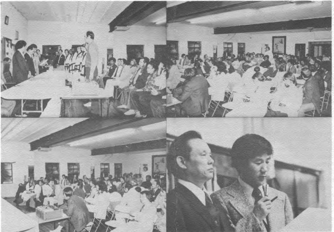
Scenes of 1st National Tang Soo Do Convention

THE UNITED STATES TANG SOO DO FEDERATION