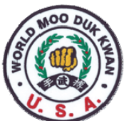
WMDK Chest Patch

will continue to be available through Headquarters for display other than on dobahks.